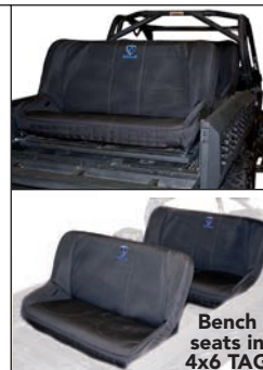
Folding Low Back Seats